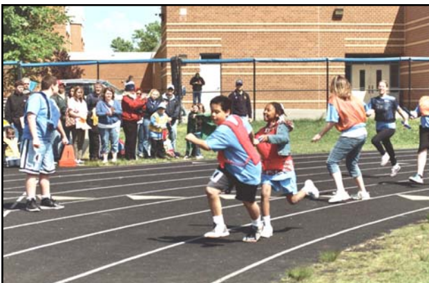
4x100 relay competitions kick off the 2010 Spring Games at Leonardtown High School.